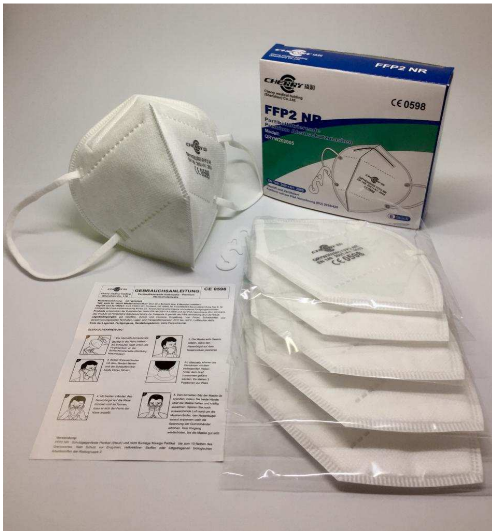
Variante: 6 Pack 6 einzeln verpackte Masken