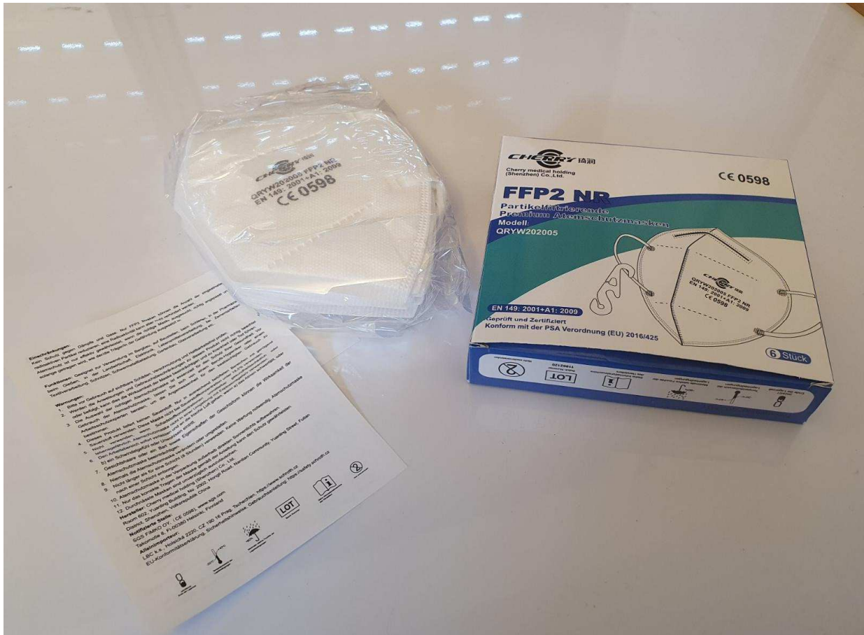
Variante: 6 Pack mit 6 FFP2 Masken in einer Tüte