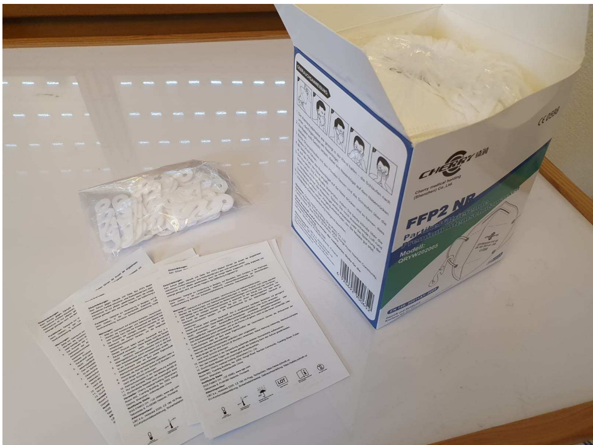
Variante: 50er Box mit 50 Masken in einer Tüte und 9 Bedienungsanleitungen Alternative auch erhältlich: 50er Box mit 50 Masken in 50 Tüten und 9 Bedienungsanleitungen